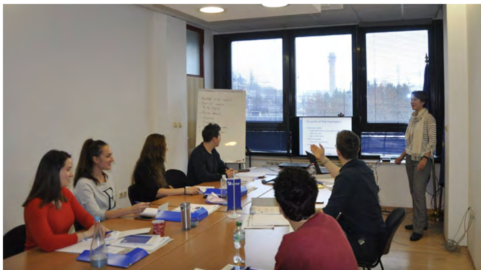
ICMP maintains a dedicated Learning and Development program, for staff and external partners