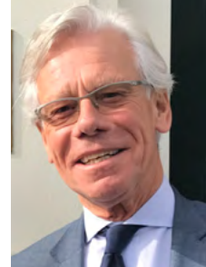
H.E. Ambassador Knut Vollebaek

Former OSCE High Commissioner on National Minorities. ICMP Commissioner since April 2005.