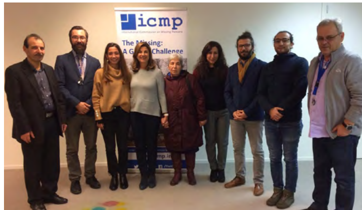
ICMP staff and Syrian civil society organizations during a workshop at ICMP Headquarters in The Hague

Multiple on-line campaigns were launched focusing on the rights of families and explaining how to report a missing using ICMP's Online Inquiry Center (OIC). Overall, during 2018 the Syria/MENA team received 415 online reports via the OIC.