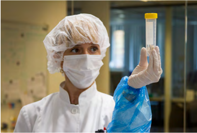
ICMP's human identification system relies on its integrated DNA laboratory located in The Hague