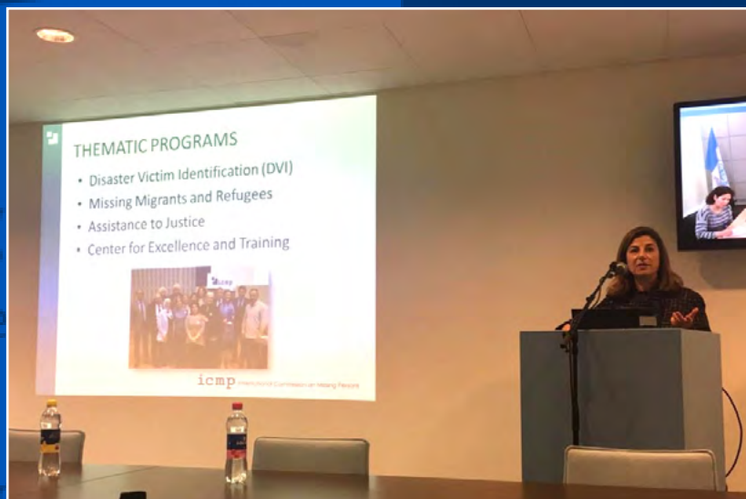
ICMP's key activities are implemented through its cross-cutting and thematic programs