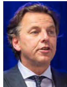
Mr. Bert Koenders

Former Minister of Foreign Affairs of El Salvador. ICMP Commissioner since February 2019.