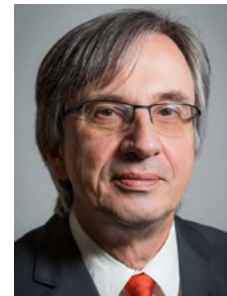
Ambassador Dirk BrengeImann

Former Minister of Foreign Affairs of the Netherlands. ICMP Commissioner since February 2019.