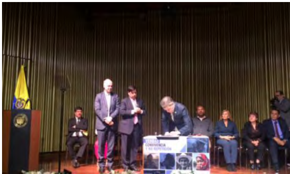
ICMP first became engaged in Colombia in 2008 following a request from the Prosecutor's Office

More than half a century of armed conflict in Colombia resulted in the disappearance of tens of thousands of people. ICMP first became engaged in the country in 2007 following a request by the Prosecutor's Office. ICMP is mentioned in the 2016 Peace Agreement signed by the Government of Colombia and the FARC-EP, as one of the international partners mandated to work with the parties to the Agreement in implementing point 5 related to victims of the conflict, and in particular on the issue of missing persons. Between September and December 2018, with the support of the German Cooperation Agency, GIZ, ICMP completed a comprehensive mapping of family associations and civil society organizations engaged in the missing persons process in Colombia. This landmark mapping will serve as a tool to facilitate collaboration with CSO groups, and to inform the design of institutional engagement with CSOs. In the last semester of 2018, ICMP also completed a process of dialogue with the Search Unit for Missing Persons, established under the Peace Agreement, to design activities for ICMP to support the Search Unit. In December 2018, ICMP secured support from the European Union for a program of assistance to the Search Unit and enhancing the capacity, public participation and engagement of families in efforts to account for their missing relatives.