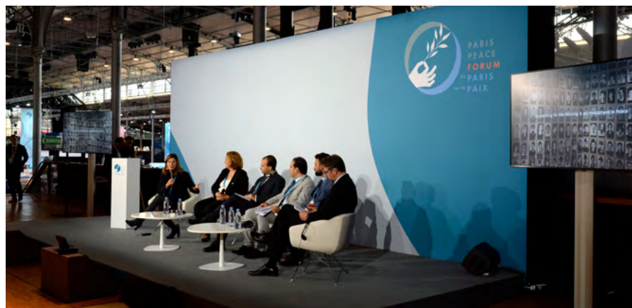
Profiles of the Missing: the panel brought together by ICMP at the Paris Peace Forum

The use of modern forensic methods and the creation of dedicated databases have made it possible to locate and identify missing persons with a level of efficiency and certainty that would have been unthinkable just a few years ago.