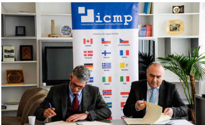
ICMP donated DNA lab equipment to Sarajevo University

In March 2018, ICMP presented Sarajevo University's Faculty of Natural Science with a comprehensive range of equipment facilitating the establishment of a new DNA laboratory at the university.