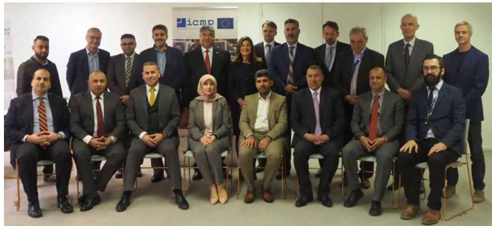
ICMP meeting with Iraqi authorities at ICMP Headquarters in The Hague