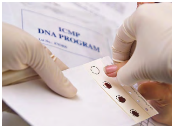
ICMP collects blood reference samples for DNA testing

ICMP assists governments and families of the missing in the process of collecting missing persons data and biological reference samples for DNA testing.