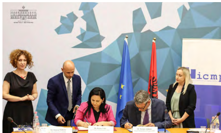
Albania and ICMP signed a cooperation agreement in July 2018

As many as 6,000 people are believed to have disappeared during the period of Communist rule in Albania, from 1945 to 1991. In July 2018, Albania and ICMP signed a Cooperation Agreement, and in November the Albanian Parliament ratified the agreement, which enables ICMP to assist the authorities in their efforts to search for and identify persons who went missing during the communist era. The agreement regulates ICMP's status in Albania, and lays out the duties and responsibilities of the signatories in the missing persons process. The initial phase of ICMP's program, which is funded by the European Union, is focused on efforts to identify missing persons recovered from the mass grave discovered near Mount Dajti northeast of Tirana in 2010 and from a site in Ballsh in southern Albania.