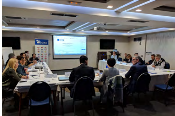
ICMP convened the first meeting of the regional Missing Persons Group in Herceg Novi, Montenegro

Slovenia and Poland signed a Joint Declaration in London. The Joint Declaration, among other things, reiterated their commitment to supporting efforts to account for the 12,000 people who are still missing as a result of the conflicts in the former Yugoslavia. It upholds the rights of all families of the missing to truth, justice and reparations, and reflects the key elements of the successful missing persons strategy that ICMP has spearheaded in the Western Balkans since soon after the end of the conflict. This strategy has made it possible to account for 28,000 of the 40,000 people who were missing at the end of the conflict, an achievement that has not been equaled anywhere in the world.