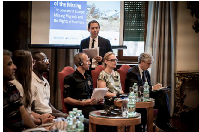
The Missing Migrants Program "Joint Process" meeting in June 2018

avenues to support the Joint Process. IOM, INTERPOL, EUROPOL, ICRC, OHCHR, FRONTEX, and the European Network of Forensic Science Institutes participated in the roundtable and expressed their support for the activities of the Joint Process.