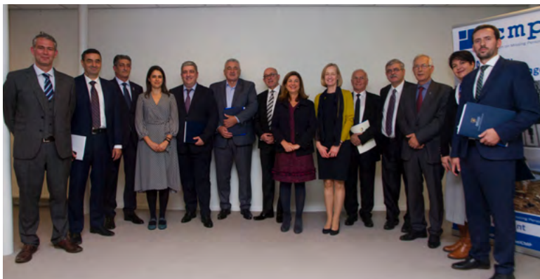
ICMP will continue to help countries of the Former Yugoslavia to account for 12,000 persons who are still missing from the conflicts of the 1990s

In the context of the Framework Plan signed by Bosnia and Herzegovina, Croatia, Kosovo, Montenegro and Serbia in November 2018, ICMP will work with the relevant institutions in these countries to make the Regional database of active missing persons cases fully operational, ensuring that data on active cases is shared securely and transparently among national partners and the public. Progress on this project, which is being supported by