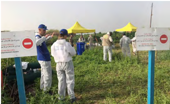
ICMP will continue to support the Iraqi authorities in the process of accounting for the missing

proposing solutions through a continuous dialogue and participatory processes;