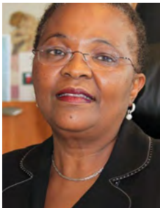
Judge Sanji Monageng

UK government minister and Member of Parliament. ICMP Commissioner since December 2013.