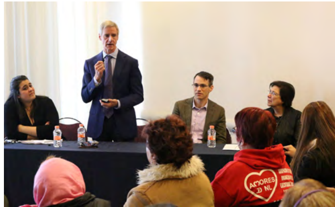
Mexico: ICMP will continue to work closely with CADHAC to support the state of Nuevo Leon

ICMP, with its partner CADHAC will support the state of Nuevo Leon in a manner that complies with the General Law on Missing Persons and the procedures and guidelines of the National Search Commission. ICMP and CADHAC will seek to bring, through the experience in Nuevo Leon, a case study of best practice that can in turn be adopted by the Federal government and other States in Mexico. ICMP's priority is to transfer experience and resources to help the new Government to launch a sustainable and effective missing persons process.