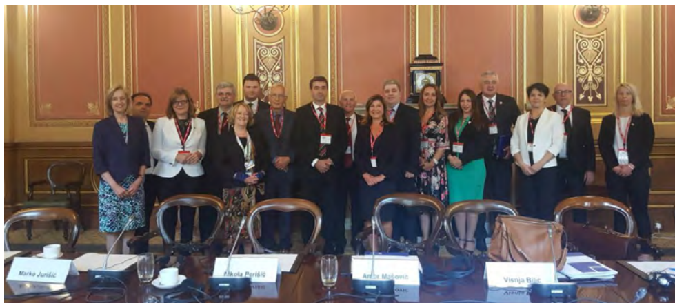
Signing of the Joint Declaration by regional leaders in London in July 2018

In July 2018, the prime ministers of Bosnia and Herzegovina, Kosovo, Montenegro, Serbia, Albania, Croatia, Germany, the United Kingdom, Austria, Bulgaria, France, Italy,