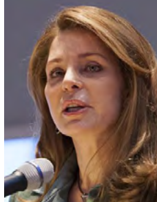
Her Majesty Queen Noor of Jordan