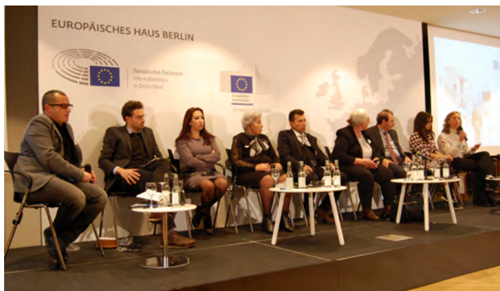
Representatives of families from Syria at the Profiles of the Missing event in Berlin, Germany, in December 2018

During 2018, the Syria/MENA program conducted 25 outreach seminars, working closely with civil society organizations. A small grants program at the end of the year drew 17